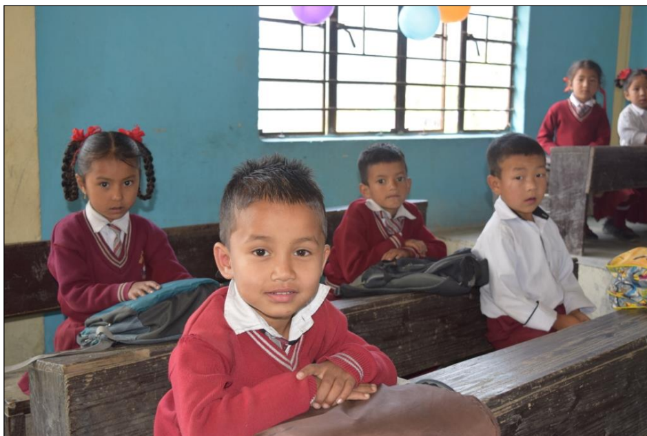
Students of Upper KG

As every year, Children's Day along with a fete was arranged in the local village ground. Students from Govt. schools and also from other sub divisions attended the sports. Businessman, village council and guardians contributed to make it a success. This year 8 schools jointly organized the annual sports.