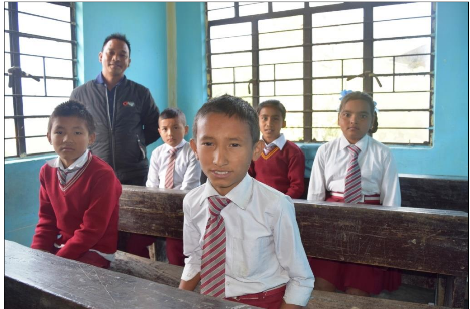
Students of Class IV