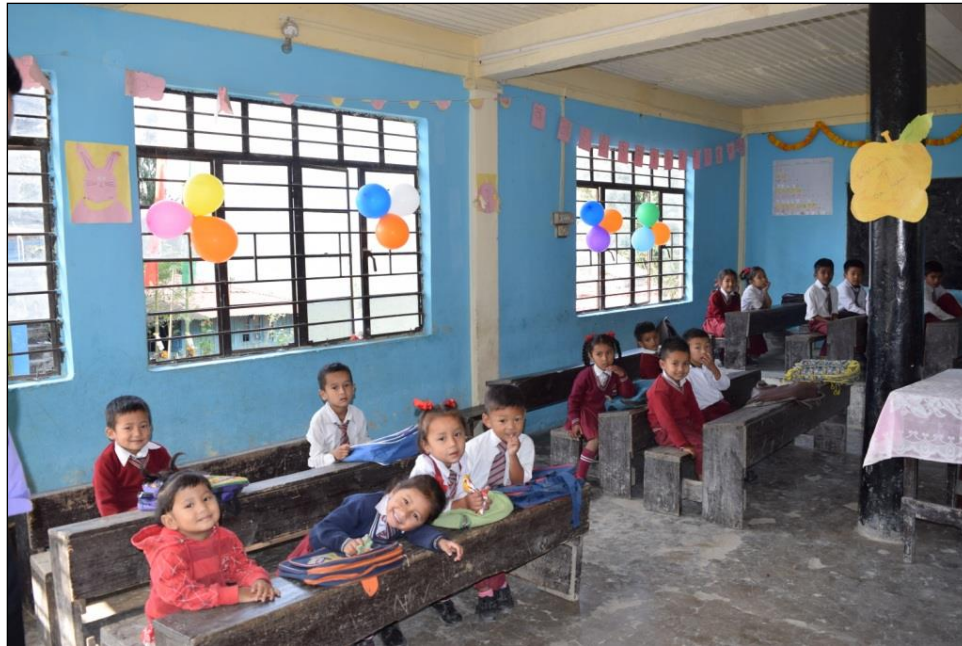
Students in a decorated class room after celebrating Teacher's Day

Some students come from very poor background and those are taught at concession rates.