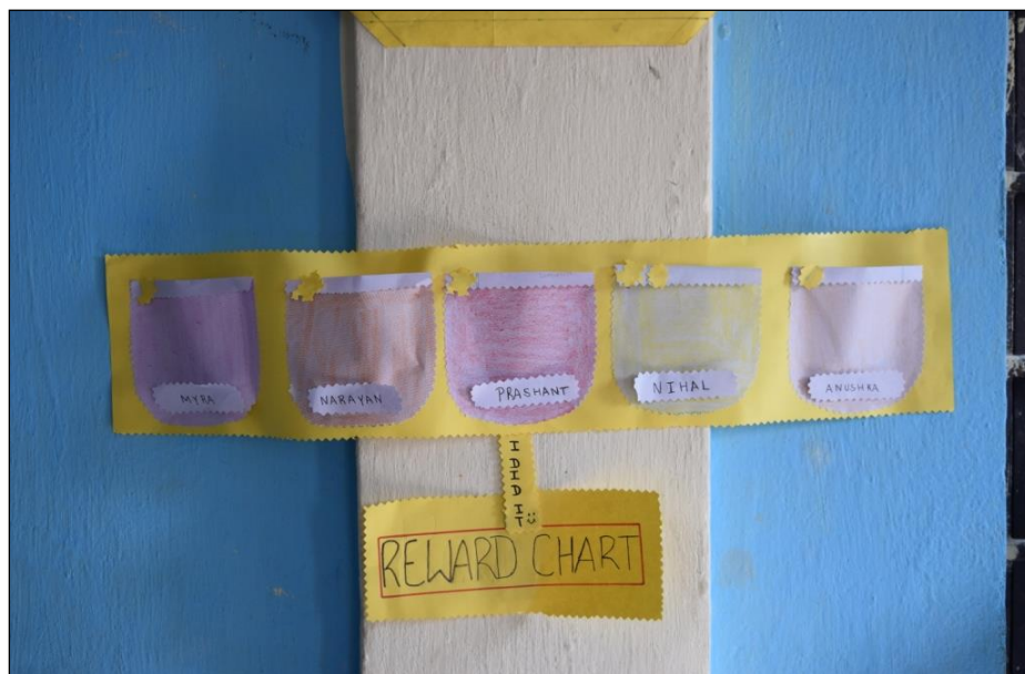
Reward Chart for students of Lower KG

DOES THE SCHOOL HAVE A PLAYGROUND?: There is no playground in the school. The children use the nearest community playground.