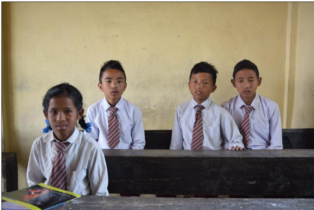
Students of Class V

The teachers, guardians and the local supervisor have a request to CHILD, Sweden, to support them till the end of 2020. Plans are being made to make the school self supported from the year 2021.