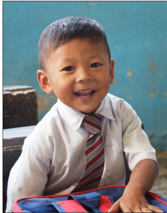
A student from KG standard

DO CHILDREN GET HOMEWORK?: Children of Class I to Class IV are given regular homework.