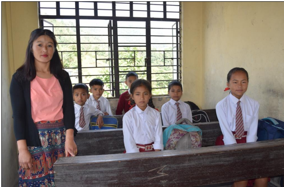
Students of Class III