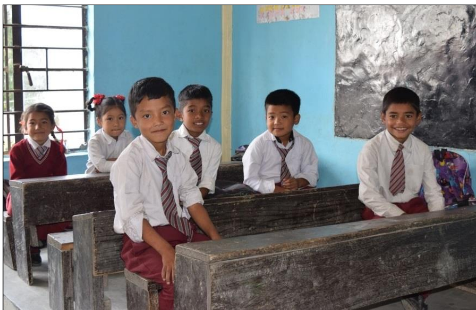
Students of Class I