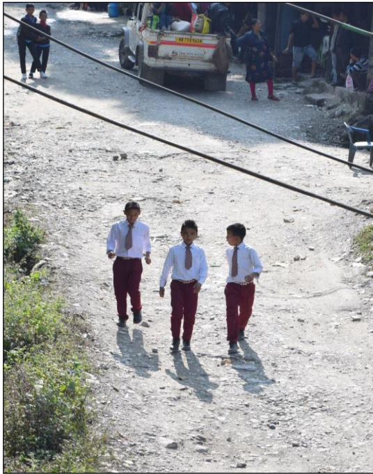
Children coming back from their home after tiffin