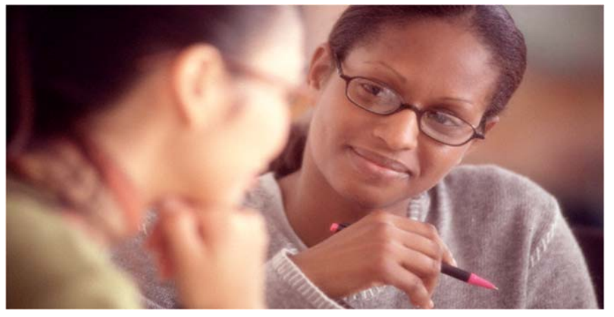
The African American Domestic Peace Project is developing a community education strategy to address domestic violence within black America.