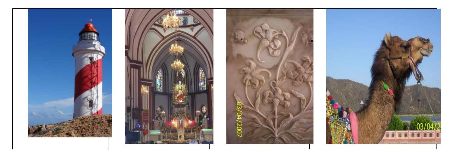
Figure 4.1 - Original 2D Image

The software available will convert 2D formats like jpeg, png, gif, bmp, tif, pdf into 3d files. But cannot be guaranteed to achieve complete accuracy. Few 2D photos were taken and converted into 3D using simple to work with 3D softwares.