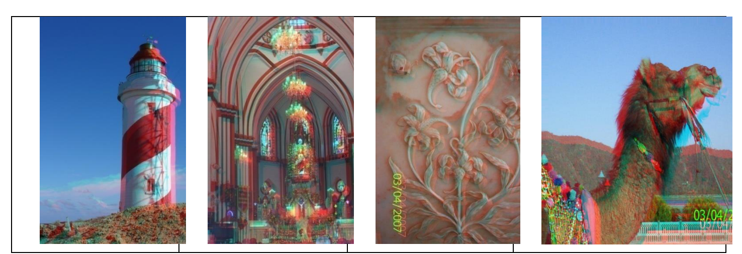
Figure 4.2 - 3D Image using Convert Image Software

ISSN: 2393-9028 (PRINT) | ISSN: 2348-2281 (ONLINE)