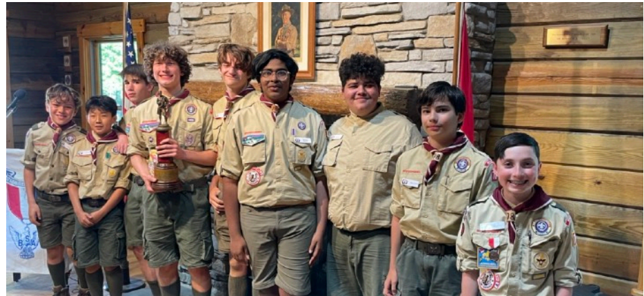
The winning patrol: Stag