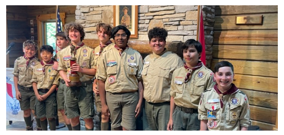
The winning patrol: Stag