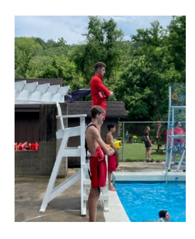
Click here for videos from summer camp.