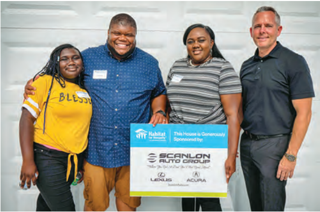
Scanlon Auto Group with new homeowners