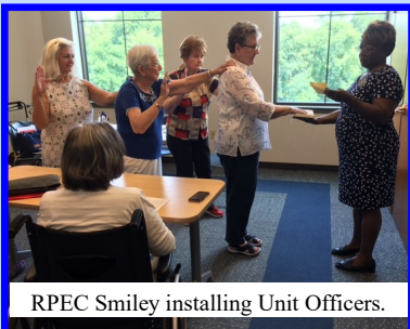
RPEC Smiley installing Unit Officers.