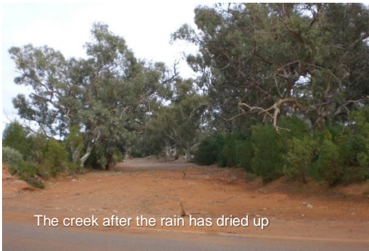
The creek after the rain has dried up