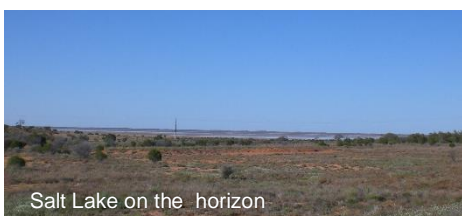
Salt Lake on the horizon