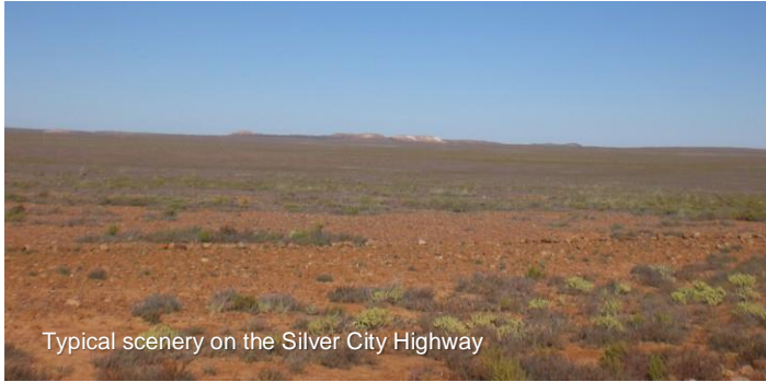
Typical scenery on the Silver City Highway