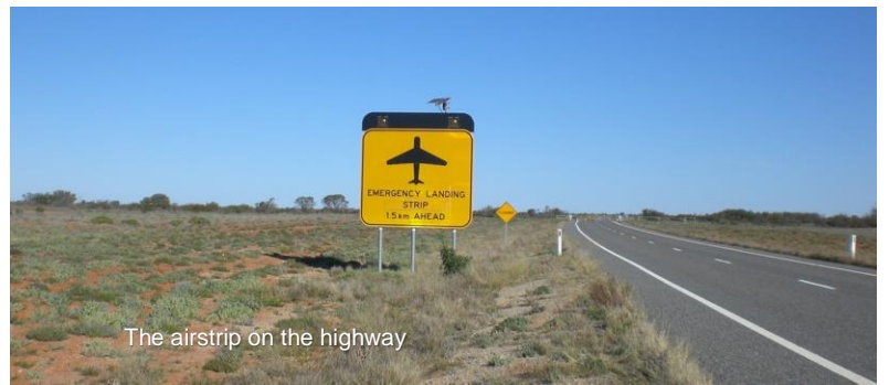
The airstrip on the highway