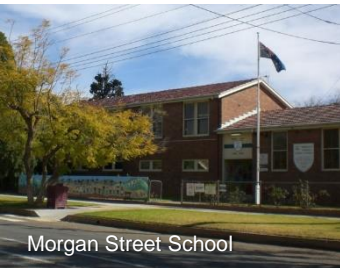
Morgan Street School