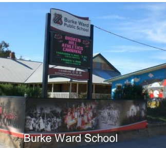
Burke Ward School