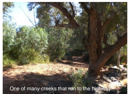
One of many creeks that run to the highway