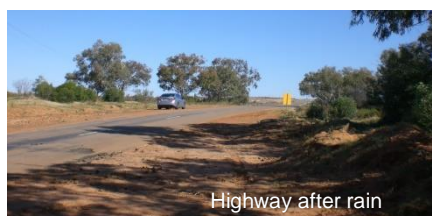
Highway after rain