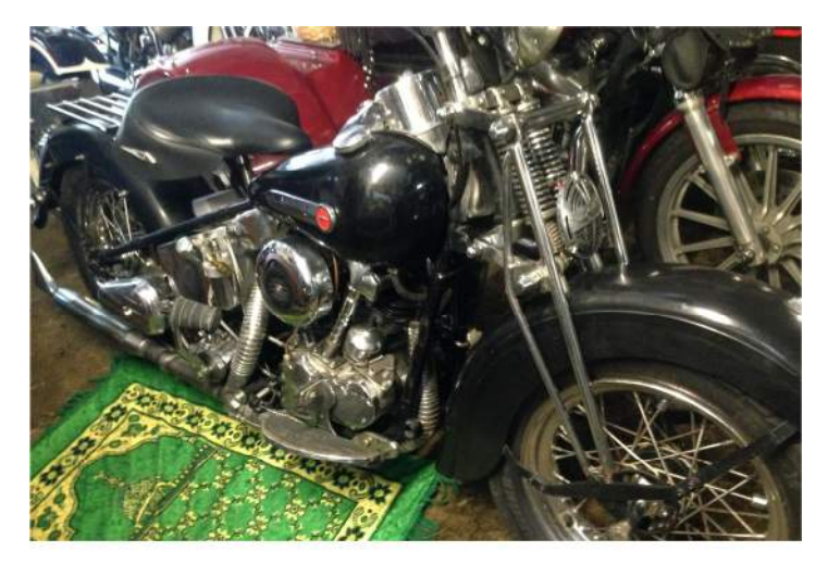
Jim Singhose's 1947 Harley-Davidson FL

September 26 Singhose Garage Crawl (cont'd)