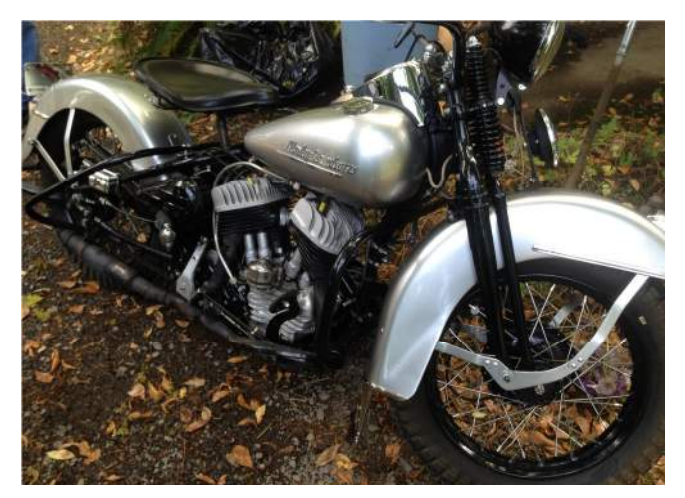
Chet Turner's 1952 Harley-Davidson WL