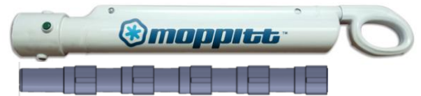
Dispenser holds multiple cleaning cartridges inside.

Patented, All-In-One , compact design with extendable handle in 3 heights. Holds multiple cleaning cartridges inside the handle and the unit stores easily in an overhead bin or hangs in a small closet. The storage bag protects the unit with pouches for extra cartridges.