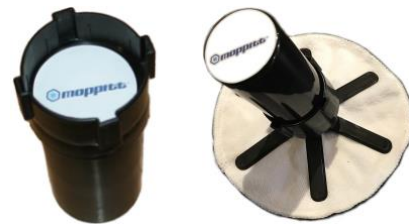
Sealed cartridge infused with cleaner. Can be used as a Hand-Held.

Infused with industry approved cleaning fluid, cartridges can be used in Dispenser, with the Extendable Pole, or as a Hand-Held to clean floors, table trays, wiping storage bins, walls, stretcher surfaces or seat backs. Cartridges are one-time-use and are recyclable.