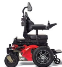
URBAN C73 FWD - JUNIOR