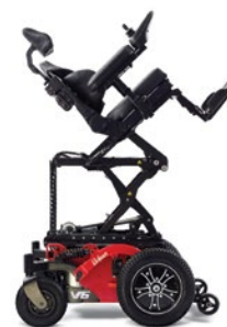
LIFT AND TILT

"WE'VE BEEN CREATING CUSTOM MADE VEHICLES FOR 22 YEARS, SO THAT YOU CAN LIVE THE LIFE YOU CHOOSE"