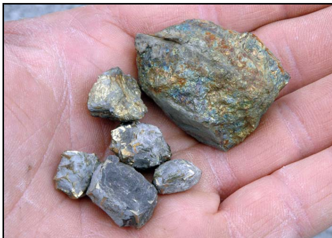
A handful of pyrite that we picked up off the ground near the shale cliff.

It didn't take us long to realize that some of the broken pieces of shale were dotted with pyrite, both massive and in crystal form. Some of the pyrite has a beautiful iridescent, metallic sheen, indicative of chalcopyrite.