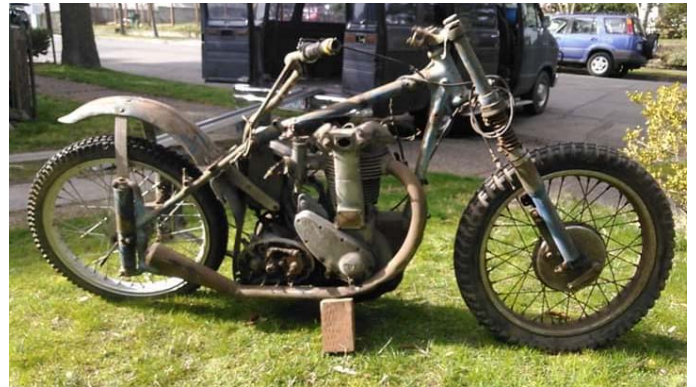
1949 BSA ZB34 Competition, "before" right side

Rambler Clubhouse. A very careful dismantle using my patented SHB method (Soak Heat & Beat) revealed the guts to be cancerous with rust, slime, and seaweed indicating that this old hill-climber was pushed into Miller Lagoon after its final victorious ascent.