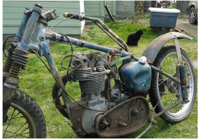
1949 BSA ZB34 Competition, "before" left side

Can you tell which bike has no guts and which is ready to ride? Your non-motorcycling friends certainly cannot determine that. You have no non-motorhead friends? Neither do I. That's why at Bill's Rattlecan Restorations we supply all of the pimp but none of that noisy, smoking, leaking power. Who wants gasoline fumes and oil stains inside your house anyway, it disturbs the cats. Now for the serious part and I'm not kidding. After retiring from self-employment, I was shocked and dismayed to learn that one's personal income is severely diminished. Restoring, or even renovating, an old cycle requires frequent trips to the cash machine and plunder of the retirement account. But that's not going to prevent me from having the fun of transforming piles of rusty junk into beautiful examples of rolling art (for optimum view please step back about six fathoms and squint). Case in point, here is a rescue BSA ZB34 Competition discovered near the Richmond