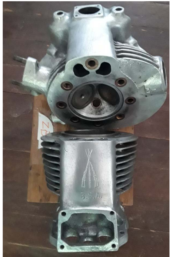
Sand cast alloy cylinder and head. These two rare items transform the common B34 Roadster visually to a Competition Model.

the poor man's Gold Star, it lacked the sturdier GS crankcases and was essentially a standard road model with the alloy top end replacing the standard cast iron items. Two years later the separate rockerbox, diecast model BB with swingarm frame was the ZB replacement soon to be followed by the more numerous and iconic CB, DB and DBD Gold Stars that are more familiar to motorcyclists.