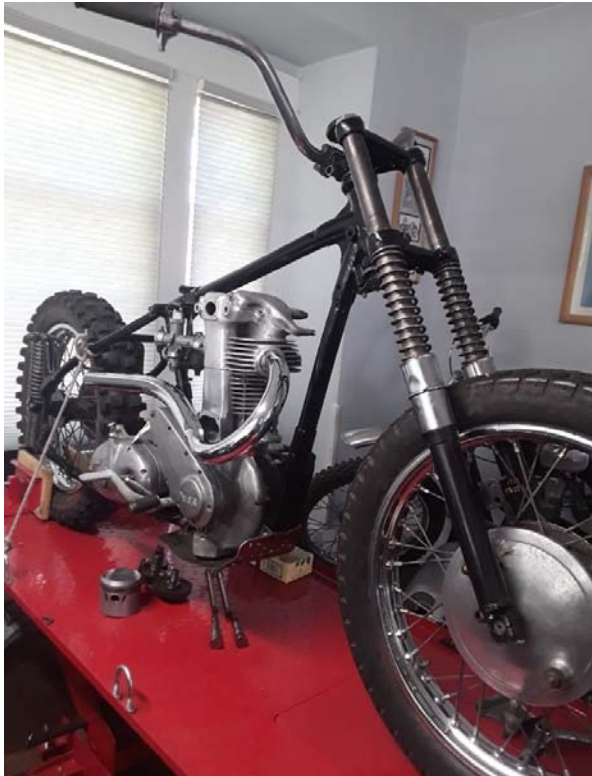
1949 BSA ZB34 Competition during reassembly

I've spent many happy Covid-19 lockdown hours cleaning, polishing and painting. My favorite lotions and potions include Ospho, Corrosion Block, Alumabrite, CoroSeal, and Rustoleum. Not much money has been spent so far, and certainly none on expensive internals, because elbow grease is exhausting, but free. Freebies from fellow BSA enthusiasts have augmented my own spares inventory to fill in the spaces where parts were either missing or too badly broken to reach the high standards of a Rattlecan Restoration.