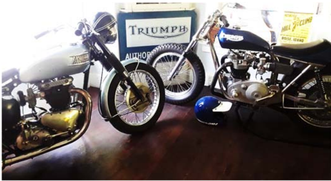
Two Triumphs: One is a runner, one has no guts

Has your crankshaft grinder grown old and grumpy, is your boring bar broke, can't afford the escalating cost of cams? Don't worry, we at Bill's have the solution: bikes built with no cranks, no cams, no bearings and come with no financial trauma to spoil the enjoyment of displaying your retired relics in the comfort and safety of your living room. (My ex brother-in-law offers marriage mediation as it will surely be required.)