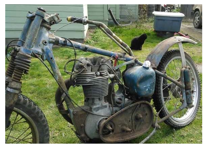
1949 BSA ZB34 Competition, "before" left side

Can you tell which bike has no guts and which is ready to ride? Your non-motorcycling friends certainly cannot determine that. You have no non-motorhead friends? Neither do I. That's why at Bill's Rattlecan Restorations we supply all of the pimp but none of that noisy, smoking, leaking power. Who wants gasoline fumes and oil stains inside your house anyway, it disturbs the cats. Now for the serious part and I'm not kidding. After retiring from self-employment, I was shocked and dismayed to learn that one's personal income is severely diminished. Restoring, or even renovating, an old cycle requires frequent trips to the cash machine and plunder of the retirement account. But that's not going to prevent me from having the fun of transforming piles of rusty junk into beautiful examples of rolling art (for optimum view please step back about six fathoms and squint). Case in point, here is a rescue BSA ZB34 Competition discovered near the Richmond