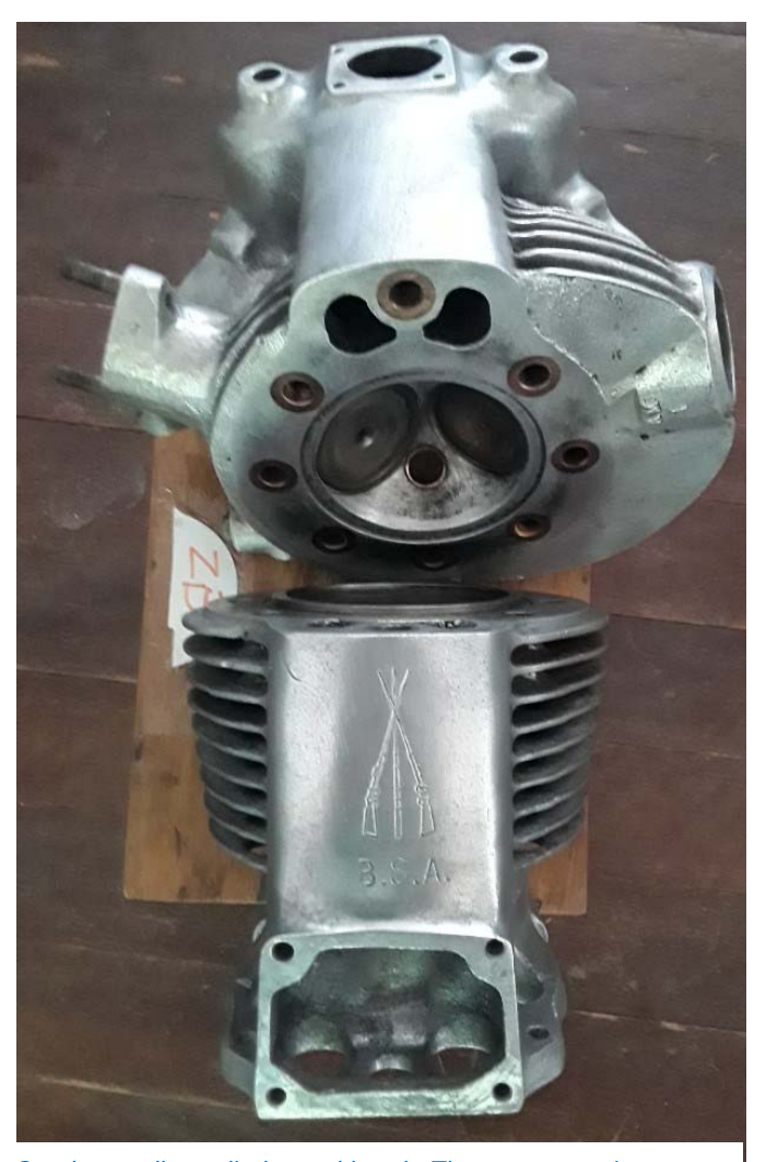
Sand cast alloy cylinder and head. These two rare items transform the common B34 Roadster visually to a Competition Model.

the poor man's Gold Star, it lacked the sturdier GS crankcases and was essentially a standard road model with the alloy top end replacing the standard cast iron items. Two years later the separate rockerbox, diecast model BB with swingarm frame was the ZB replacement soon to be followed by the more numerous and iconic CB, DB and DBD Gold Stars that are more familiar to motorcyclists.