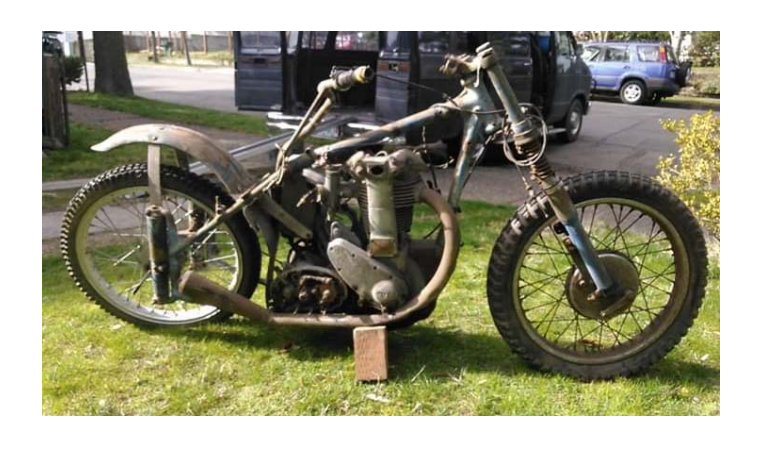
1949 BSA ZB34 Competition, "before" right side

Rambler Clubhouse. A very careful dismantle using my patented SHB method (Soak Heat & Beat) revealed the guts to be cancerous with rust, slime, and seaweed indicating that this old hill-climber was pushed into Miller Lagoon after its final victorious ascent.