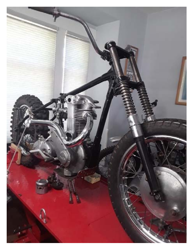
1949 BSA ZB34 Competition during reassembly

I've spent many happy Covid-19 lockdown hours cleaning, polishing and painting. My favorite lotions and potions include Ospho, Corrosion Block, AlumaBrite, CoroSeal, and Rustoleum. Not much money has been spent so far, and certainly none on expensive internals, because elbow grease is exhausting, but free. Freebies from fellow BSA enthusiasts have augmented my own spares inventory to fill in the spaces where parts were either missing or too badly broken to reach the high standards of a Rattlecan Restoration.