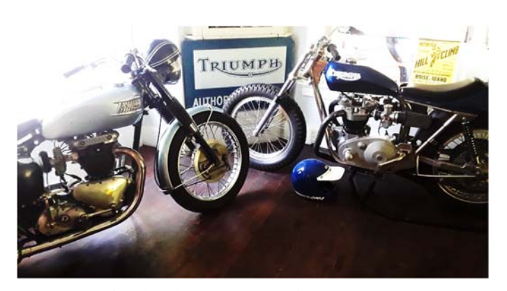
Two Triumphs: One is a runner, one has no guts

Has your crankshaft grinder grown old and grumpy, is your boring bar broke, can't afford the escalating cost of cams? Don't worry, we at Bill's have the solution: bikes built with no cranks, no cams, no bearings and come with no financial trauma to spoil the enjoyment of displaying your retired relics in the comfort and safety of your living room. (My ex brother-in-law offers marriage mediation as it will surely be required.)