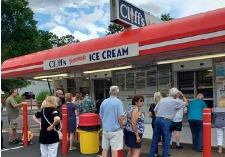
Plenty more pictures on our website