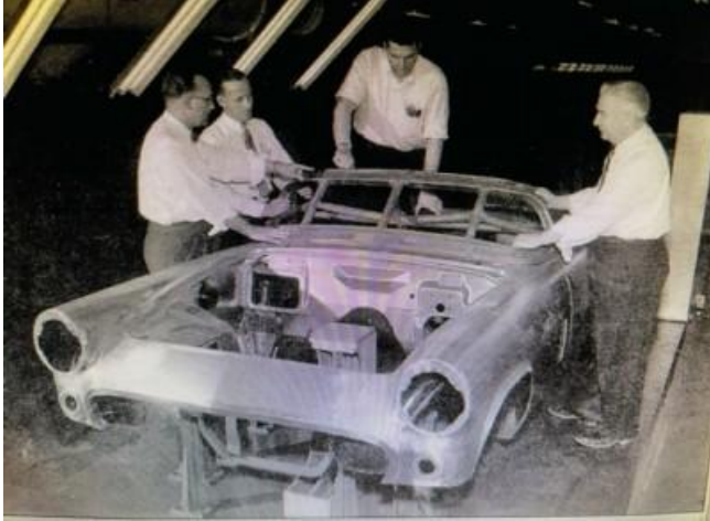
Budd Co. engineers thrashing out the new Thunderbird