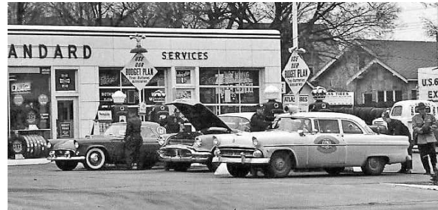
Typical late 50's Service Station