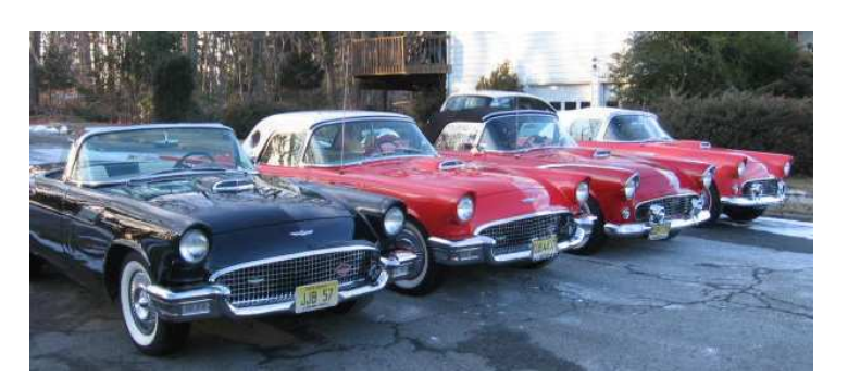
Spring March 20th is the Vernal Equinox. That means Spring is coming. Hoorah!!!