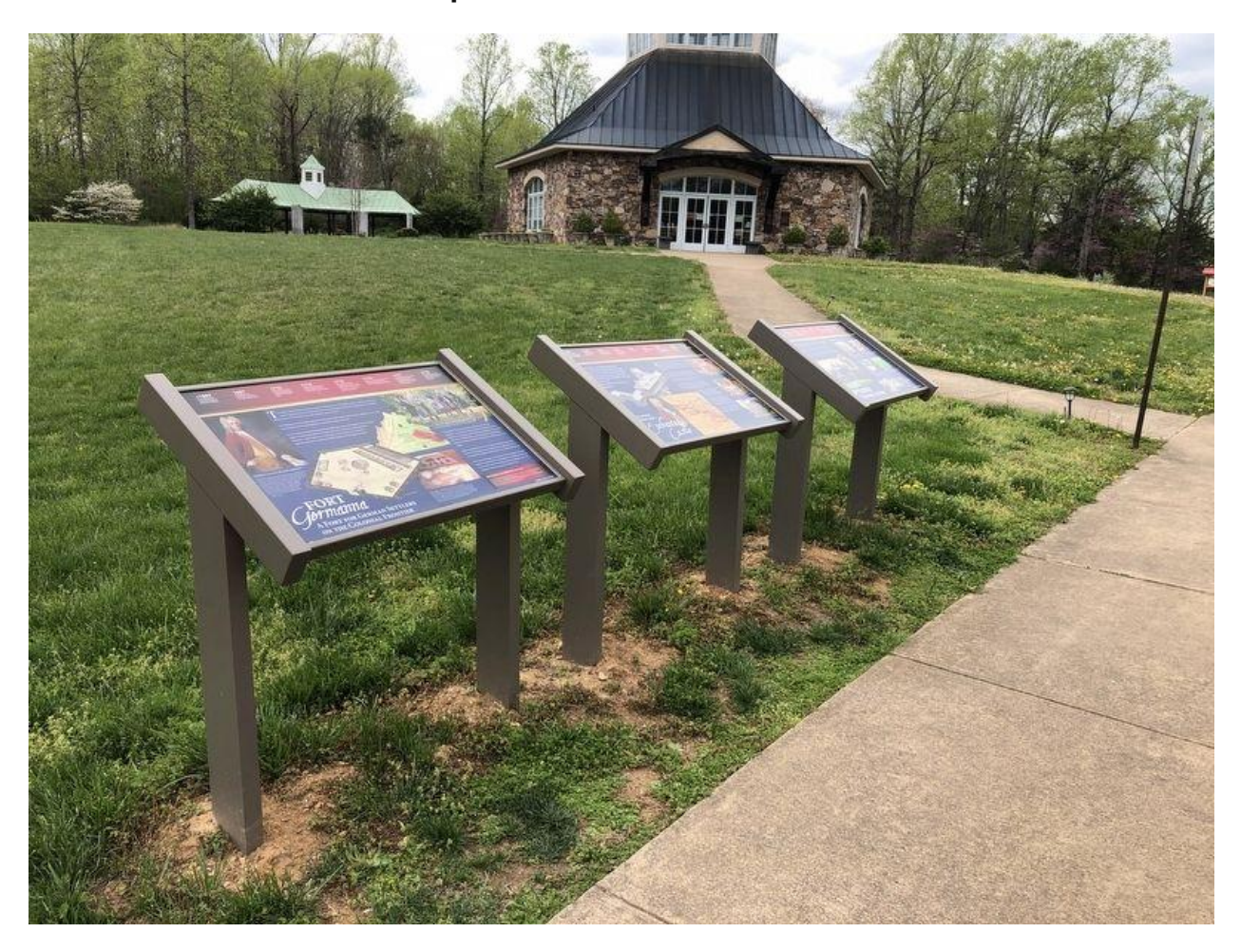
Photographed By Devry Becker Jones (CCO), April 17, 2021