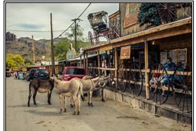
PHOTO OP AT COOL SPRINGS AZ ON ROUTE 66 FREE