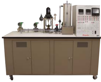
H-ICS-8189 Process Control Trainer