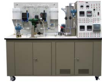
H-ICS-8189-4pH Instrumentation, Controls & pH Control Trainer