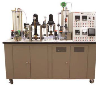
H-ICS-8189-4 Instrumentation & Controls Trainer