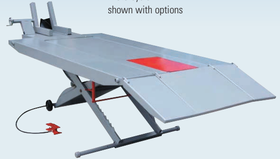
M-1000C Motorcycle lift shown with options