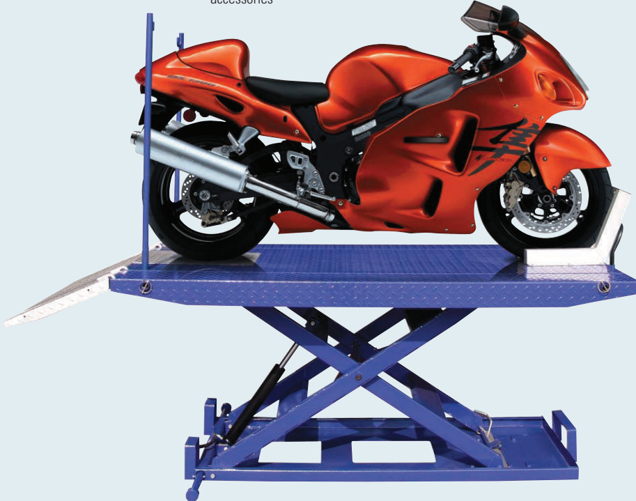
M-1500C-HR Motorcycle lift shown with standard accessories

These lift tables are ideal for making repairs to motorcycles, snowmobiles, ATVs, jet skis, etc. Choose from a range of accessories to customize these tables for your shop.