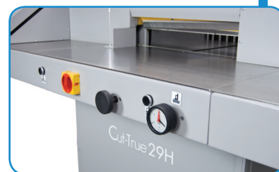
Two-button operation, fine-tune knob, adjustable hydraulic pressure gauge