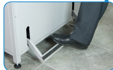
Foot pedal pre-clamp holds paper to check alignment prior to cutting