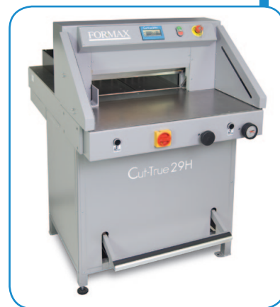
Standard model, without side tables