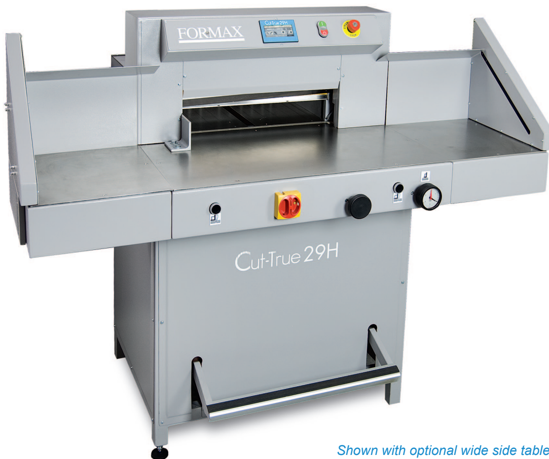
Shown with optional wide side tables

The Formax Cut-True 29H Hydraulic Guillotine Paper Cutter offers precision cutting for paper stacks up to 20.5" wide. User-friendly, intuitive features include a touchscreen control panel, automatically-adjusting back gauge and the capacity to program up to 100 jobs/100 cuts . An infrared light beam safety curtain provides safety and convenience as it shuts down operation if the light plane is interrupted.