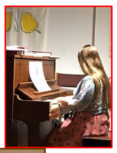
CLC Annual Variety Show