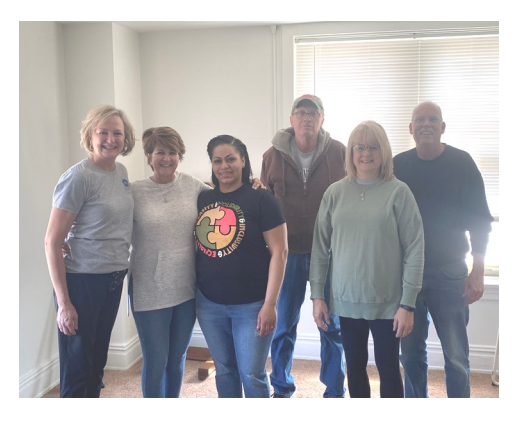
Destiney & Humble Beginnings volunteers