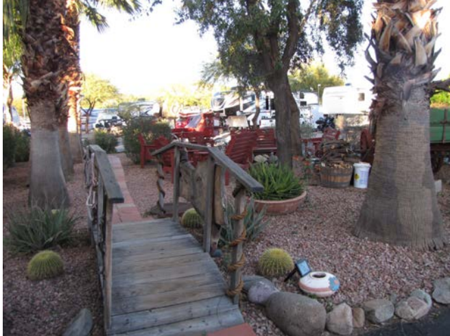
We have traveled to Black Canyon RV Resort in the past and enjoyed the park and surrounding area.