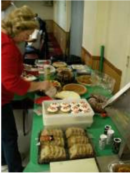
Uhhhh Look at all those Deserts!! They also disappeared as quickly as being put on the table.