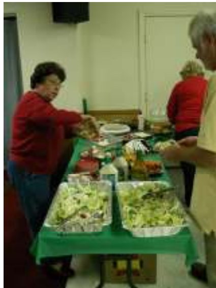
There was salad, desert then the Pasta! Save the best for last!