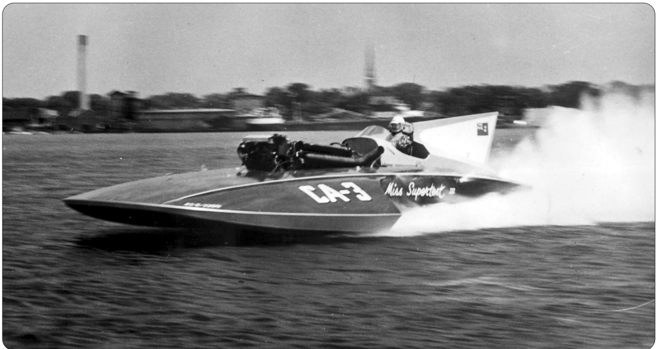
Hydroplane and Raceboat Museum

Oh, the Three was in excellent shape. The Two was certainly starting to show a bit of age, but still in good shape. But, other than the first