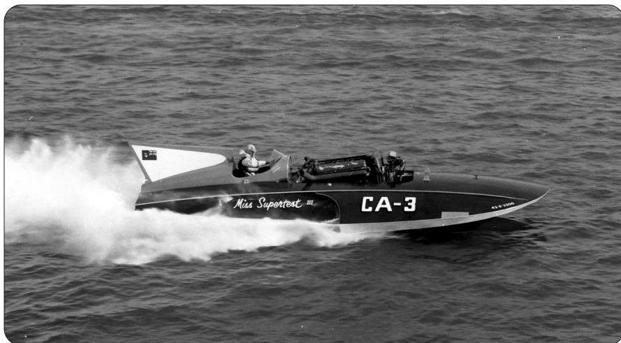
The CA-3 Miss Supertest III in 1959.