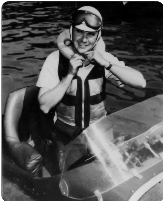
Hydroplane and Raceboat Museum

"Let's fact it, they're relatively easy to build. No difficult parts in them. But our own people built it. One of the young chaps from the company. We borrowed another young chap from another company. Two, I guess, from another company."