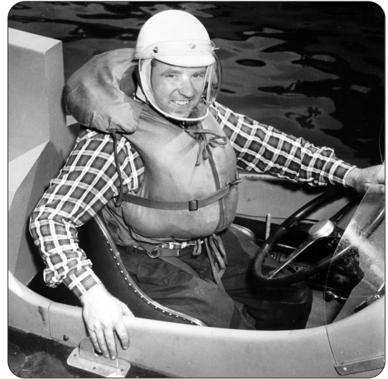
Hydroplane and Raceboat Museum

Now, there was a rumor that, had the accident not happened, you were thinking of taking the Three out to Seattle for the '62 Gold Cup.