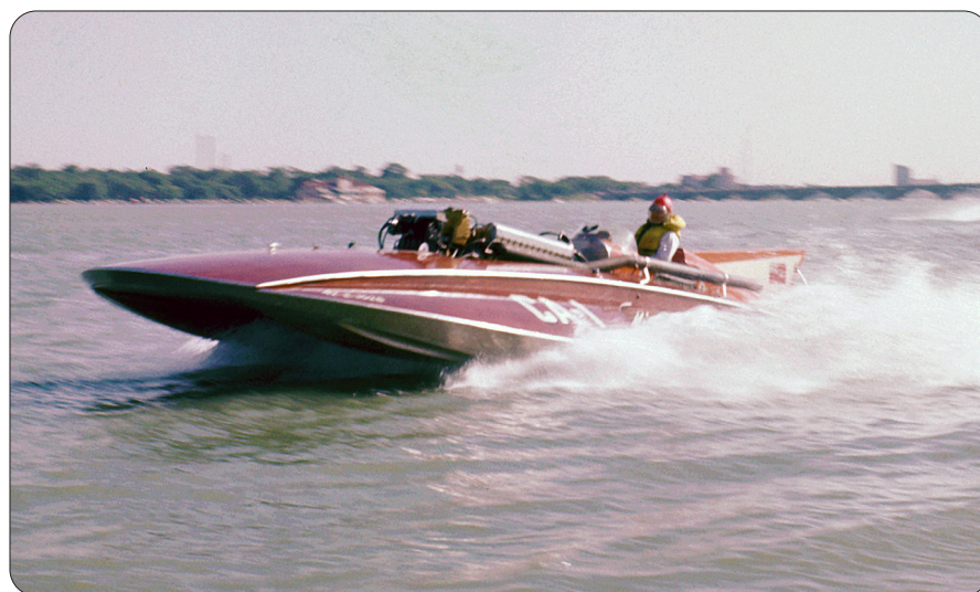
The CA-1 Miss Supertest II in Detroit in 1960.