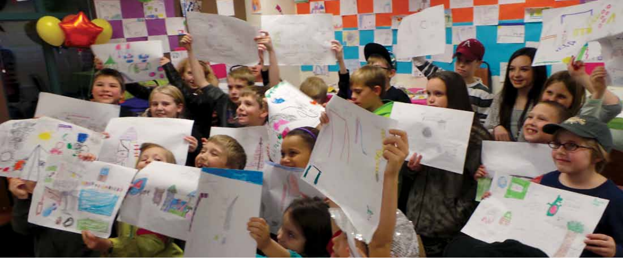
Question 11: What would make Vilonia a more vibrant, enjoyable and successful community as it relates to schools and community facilities?

Community center with weekly or monthly activities or programs would be beneficial