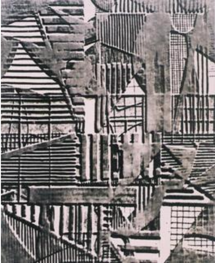
“Sails of Silence” by Elwood Decker