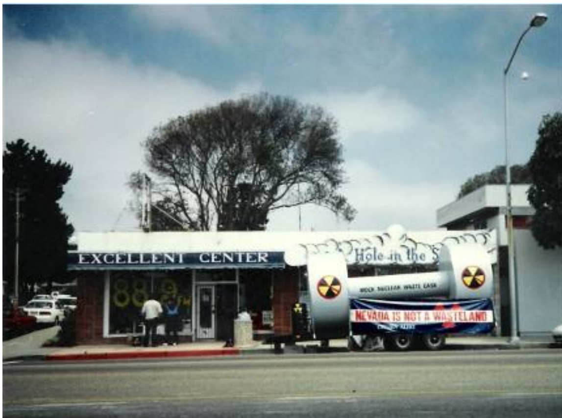
The second “A Hole In The Sky” store opened in 1984. The Excellent Center opened in 1992.