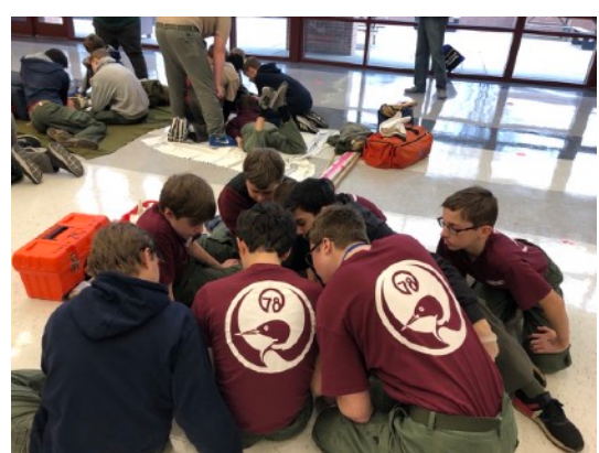
Council First Aid Meet, BPE (Before Pandemic Era)