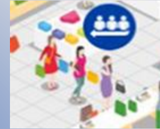
Maintain "Safe Distancing"