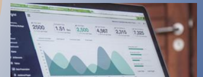
Data and intelligence to keep you in control