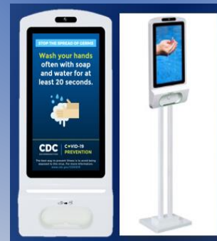
Sanitization & Health Promotion