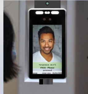
Realtime temperature checks: < .05 secs