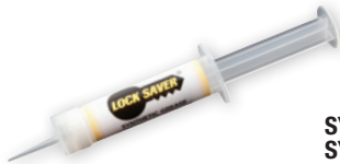
SYNTHETIC GREASE SYNTHETIC OIL