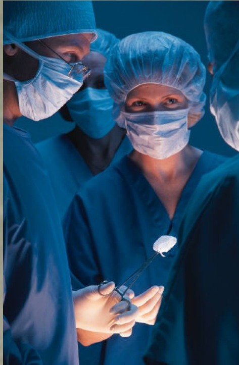
Many things in life, such as healing from surgery, never depend on man. Sometimes God blesses, sometimes He does not bless no matter what the medical society does. If a sick or injured person is not saved or is saved and not living right, it may be that another person who is praying for that sick person can bring a blessing from God because he is saved and living right.

faith and obedience if we pray for him? The Bible says that it rains on the just and the unjust, so likewise a person who is not serving God may get a blessing if a person who serves God prays for him.