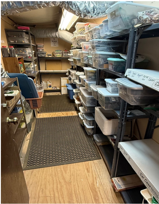
Scenery & N Gauge Room