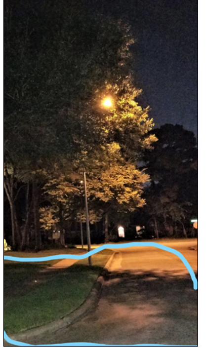
NOT ACCEPTABLE lighting is blocked by tree branches .