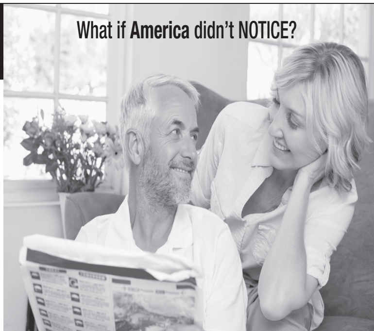
What if America didn't NOTICE?

To submit a Public Notice call 928.778.0500. ext. 1079 or email to legals@prescottaz.com