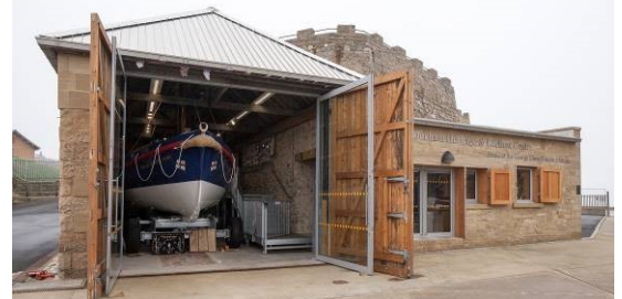
East Durham Heritage and Lifeboat Centre

You can learn more about the history of Seaham and the marina by visiting the East Durham Heritage and Lifeboat Centre , home to the famous George Elmy Lifeboat.