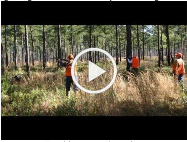
Smoking Gun Plantation

<u>759 Acres in Worth County GA: Smoking Gun Plantation</u>, $2,850,000 (includes all equipment, furnishings, dogs, and commercial quail hunting business).