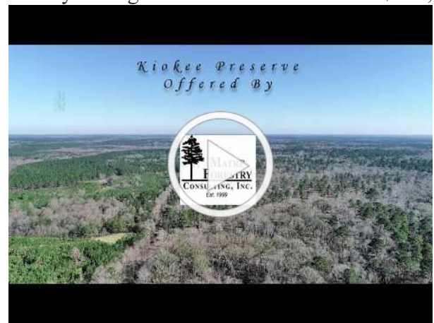
Kiokee Preserve for Sale

<u>252 Acres in Terrell & Dougherty County GA</u>: HBU Timberland. Kiokee Creek Preserve. Ideal for future development or a permanent conservation easement. Gorgeous property actively managed for timber and wildlife. $749,700