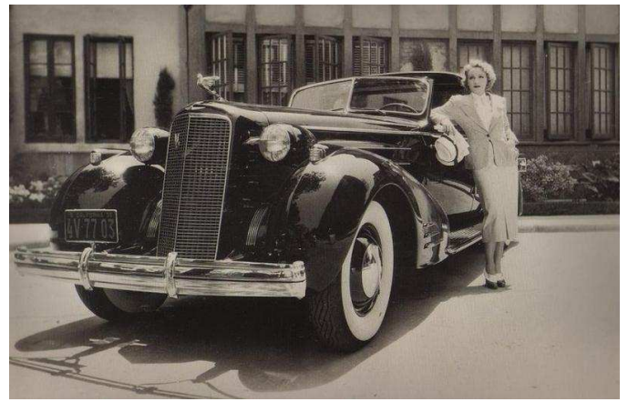
Marlene Dietrick - 36 Caddy