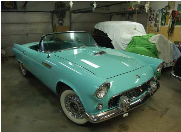
The Swedish 55