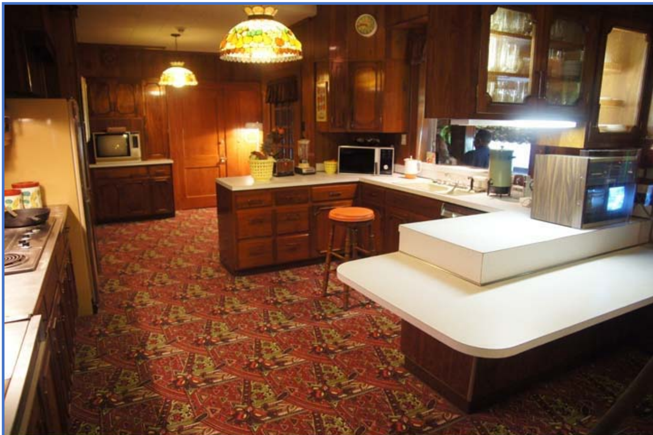
The very “modest” kitchen.