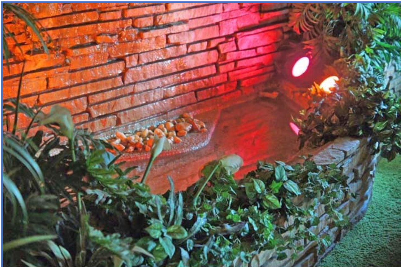
A close-up of the fireplace.