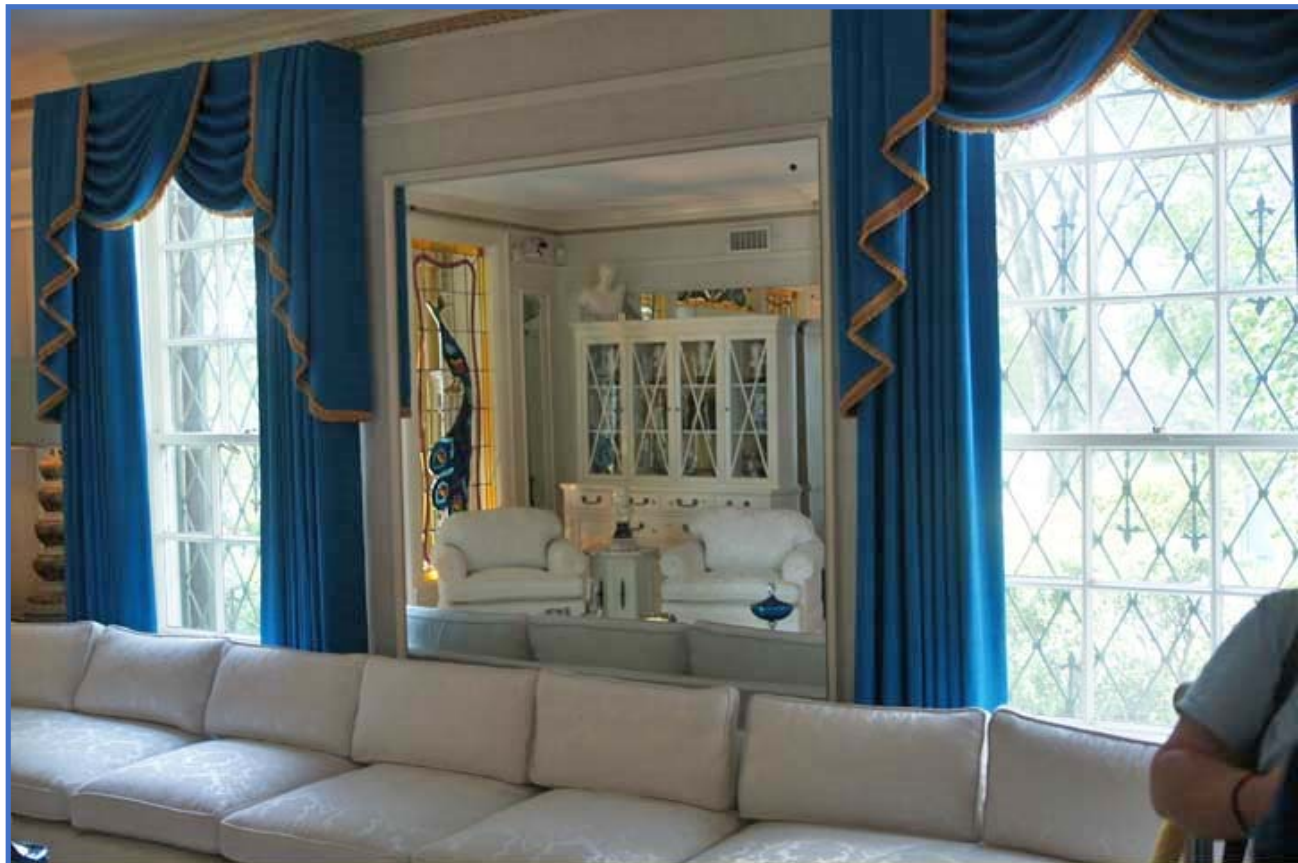
Another view of the living room.