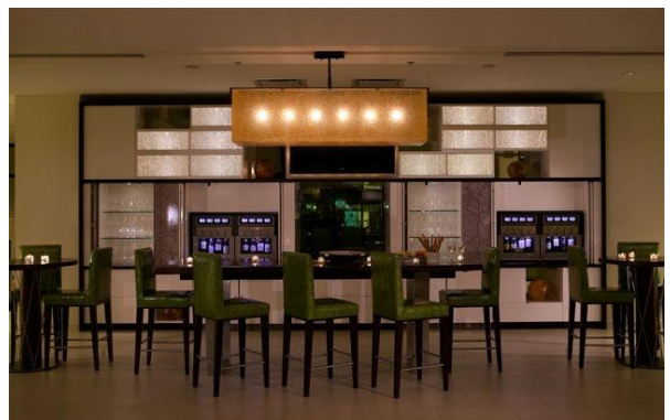
Lobby Wine Bar