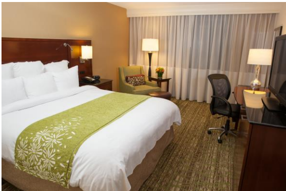
King Bed Guest Room