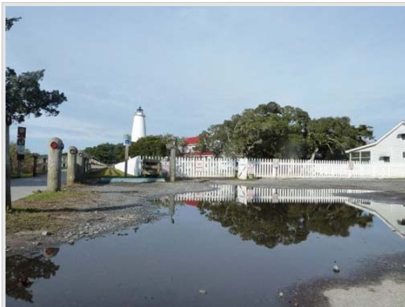
Standing water near the lighthouse over a week after a rain.