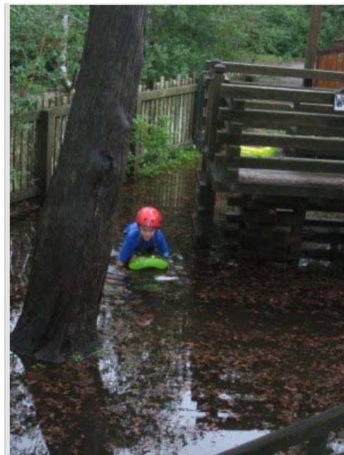
Playing in the puddles on Howard Street.

There will never be solutions for major storms and extreme high tides, agreed everyone. But there may be a time when school children are no longer carried from their parents' cars to the school steps, and optimists might even envision a future where kids once again leap from docks to swim in the harbor after school.