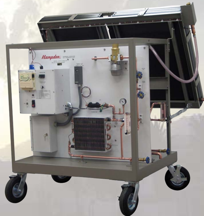
Model H-SST-1A Shown with CDL Computer Data Logging Package and FP Fault Package Options

Gauges, thermometers, and flowmeters permit students to observe pressures, temperatures, and flow rate while the system is in operation. The trainer is mounted on a mobile frame and the collector panel is adjustable for easy positioning in direct sunlight.