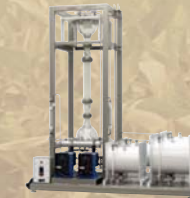
Model H-6150-TT Liquid-to-Liquid Extraction Demonstrator option

The Hampden Model H-ETS-1A Ethanol Production Process System is designed to facilitate the instruction of students on the process required to produce ethanol for experimental purposes. Ethanol is a very promising fuel alternative to oil since sources are widely available and ethanol is clean-burning. The student will be able to observe and control the process of producing ethanol from corn, sugar, sorghum, fruits or several other sources. When using this unit along with the Model H-6150-TT Liquid-to-Liquid Extraction Demonstrator option, it is possible to produce ethanol with high purity.