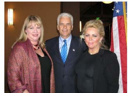
U. S. Senator John Ensign and unidentified attendees.