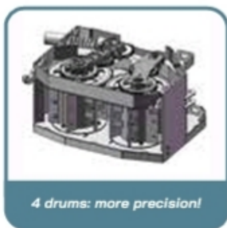
4 drums: more precision!