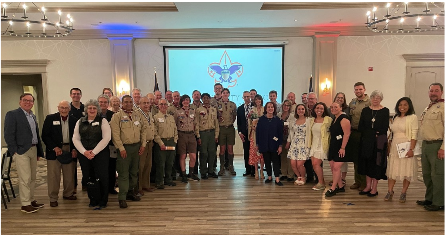
TROOP 78 CONTINGENT