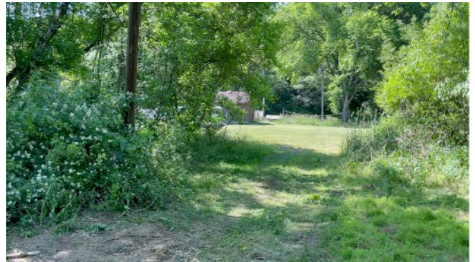
VIEW FROM THE NEW BOATING AREA TO THE POOL