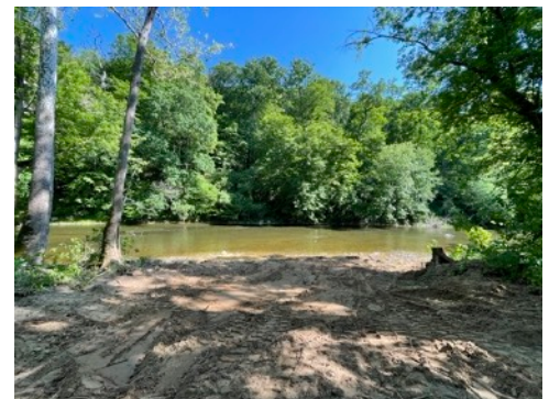
NEW BOATING AREA