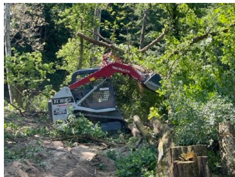
CLEARING THE AREA