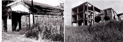
The abandoned Aso Yoshikuma work office (left) and ruined Aso Yoshikuma mine buildings in the late 1970s. Neither structure remains today.

At this passage readers may wonder if thinking of Prime Minister Abe and Foreign Minister Aso on the forced labor issue during World War II may have been influenced one way or another by his family background. We believe the article overall is intended to diminish the position of these two politicians, who respect and honor fundamental values, such as freedom and human rights, and who has been working sincerely and painstakingly to encourage their adoption worldwide. Thus, the article's stance is far from being wholesome.