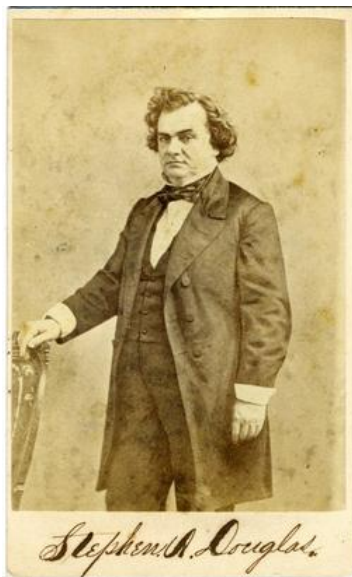
Stephen Douglas (1813-1861)

Now back from his five month long European tour, Stephen Douglas returns to the Senate eager to resume his crusade on behalf of opening the Nebraska Territory.