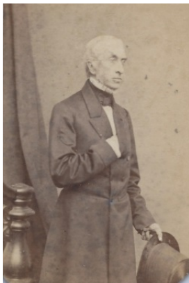
Robert Winthrop (1809-1894)

...shall not be construed as to apply to the Territory (in) this act, or to any other Territory of the United States; but that the citizens of the...several Territories shall be at liberty to take and hold their slaves within any of the Territories of the United States...