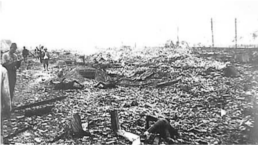
The aftermath at the hypocenter: surveying Nagasaki's devastated Matsuyama district.

Kamikawa's sister survived, but on August 12 he and an uncle went searching on foot for relatives living 800 meters from ground zero. "The nearer we approached to the hypocenter, although we did not yet know what the bomb was or where the hypocenter was, the more tragic the damage became. It was far beyond my comprehension. There were lots of dead bodies in and along the river; their strength must have drained away there while looking for water. There were also some carbonized dead bodies still sitting on the seats in the tramcar, which had been all burned except for half-melted iron. While passing through the city, I saw many half-burned dead bodies and corpses crushed by debris being cremated here and there using old wood." Kamikawa's relatives were never found.[8]