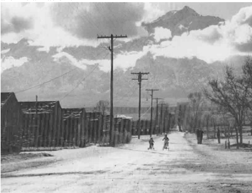
Beginning in 1942, more than 110,000 ethnic Japanese were uprooted from their homes and interned in desolate camps like this one at Manzanar.

More than 110,000 ethnic Japanese, about two-thirds of them native-born U.S. citizens, were relocated from the American West Coast and interned in ten barren, military-run internment camps between 1942 and 1945. Military necessity was the reason given for the policy authorized by FDR's executive order and ruled constitutional by the U.S. Supreme Court, but the policy was driven by anti-Asian racism.