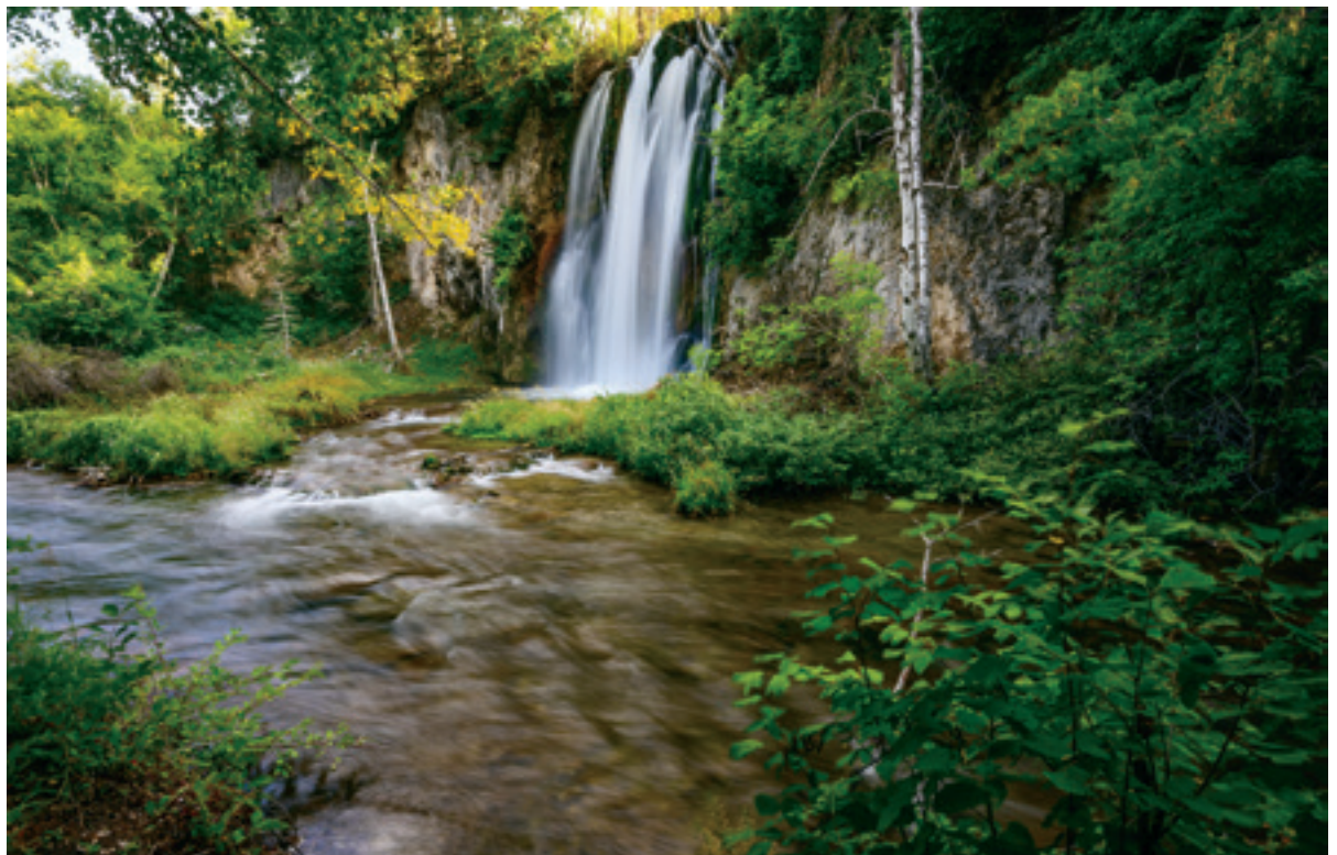
Spearfish Falls

There are more locations for which we will provide information so that you can tour on your own with easy access. There is Mount Rushmore, Wall Drug, Downtown Rapid City Art Alley, the Walk of the Presidents, and more. Make plans to register early so that you will have a reserved spot for your favorite tour! ■