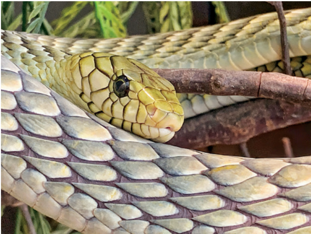
Reptile Gardens