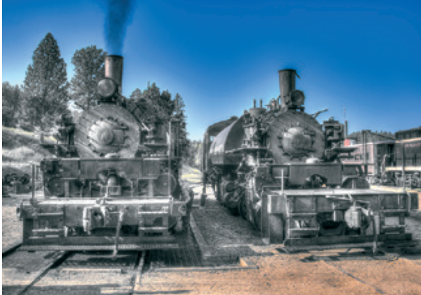
1880 Train

Spearfish Canyon is the Northern Hills' number one natural attraction. A great spot for wildlife enthusiasts, as the diverse array of plant