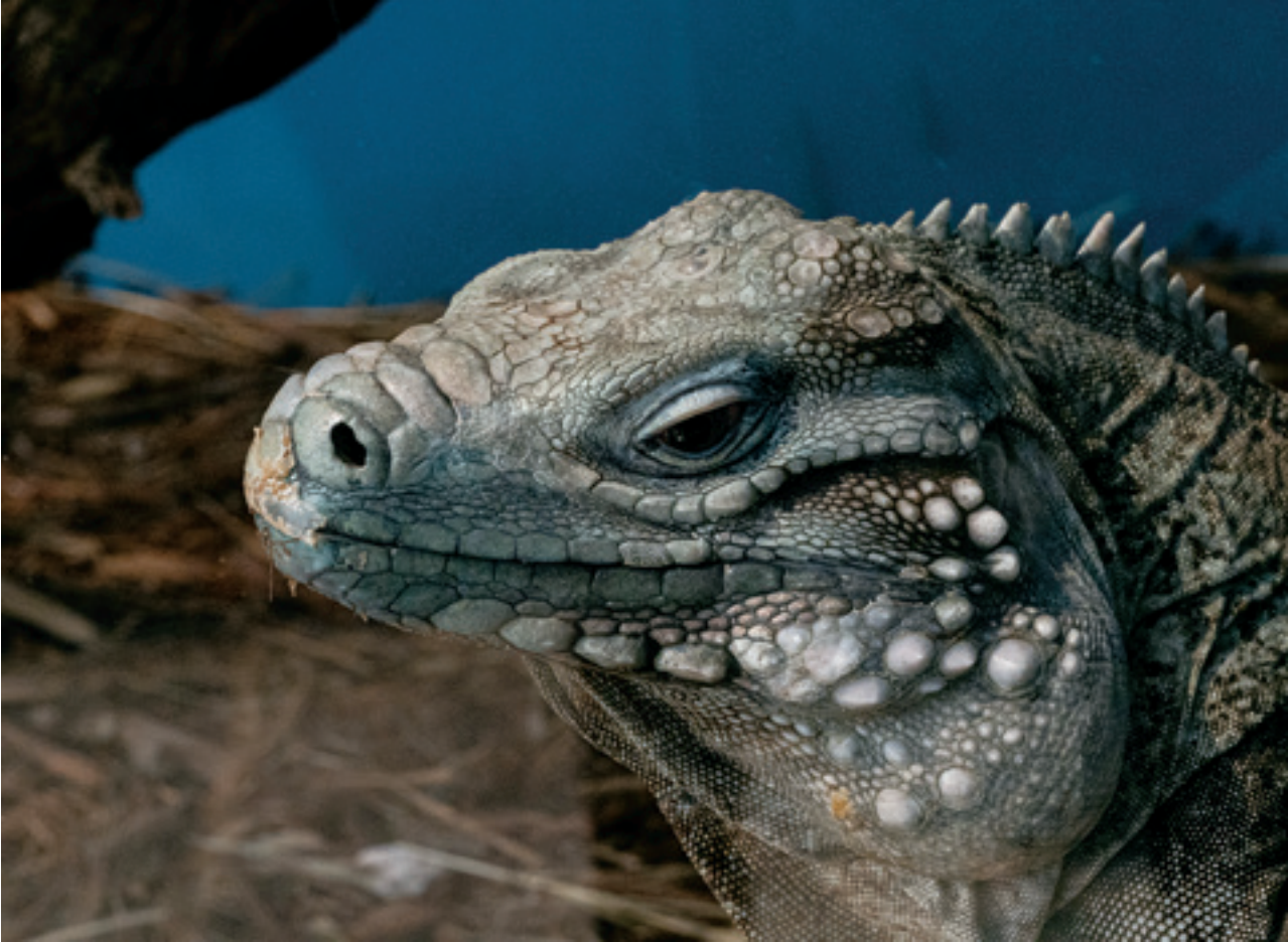
Reptile Gardens © Ralph Durham, APSA