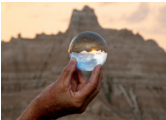
Badlands 9

The park protects 242,756 acres of sharply eroded buttes and pinnacles, along with the largest undisturbed mixed grass prairie in the United States. The mixed-grass prairie of the park is where bison, bighorn sheep, prairie dogs, and black-footed ferrets live today. The formations in the park contain sandstones, siltstones, mudstones, claystones, limestones, volcanic ash, and shale. We will be offering sunrise and sunset tours daily to the park so you can see and photograph some of the most brilliant colors of the peaks!