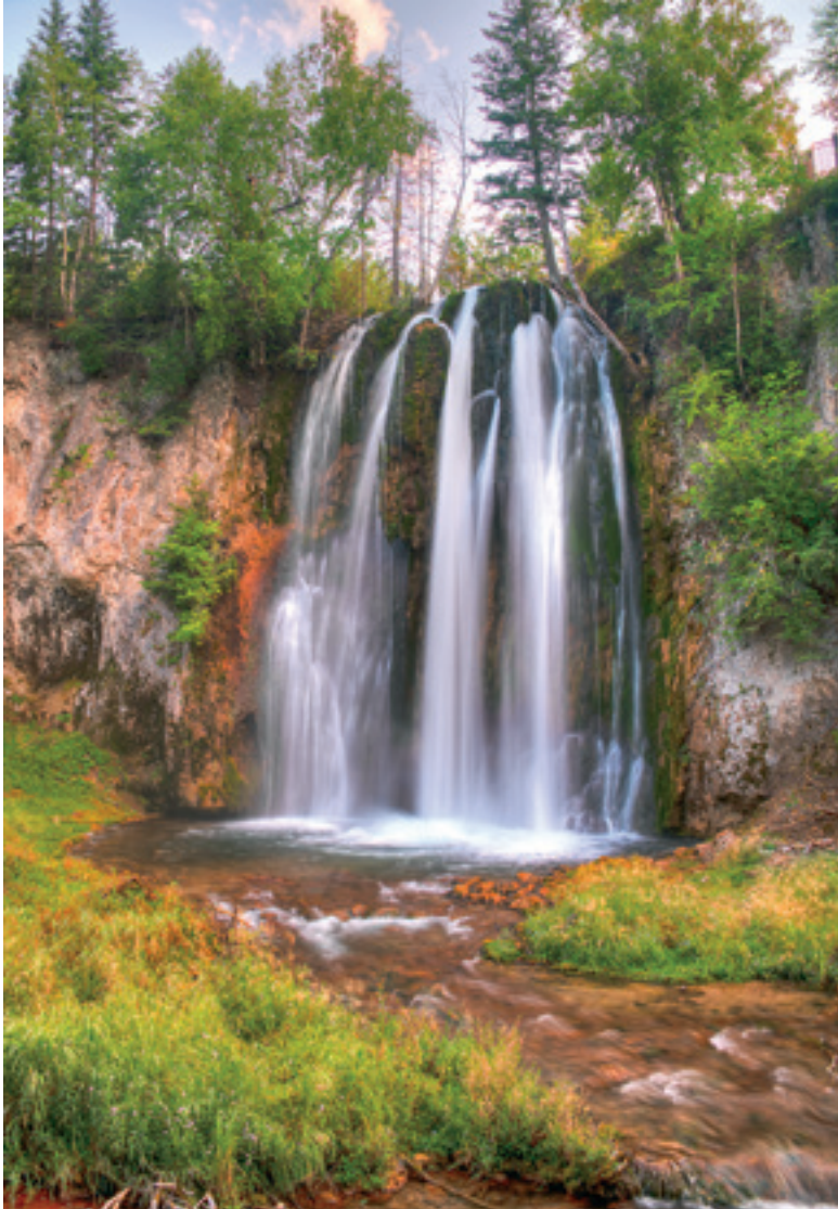
Spearfish Falls

life, provides a comfortable home for deer, mountain goats, porcupines, and bobcats. The Spearfish Canyon tour will be an all-day tour through the gorge following a trail filled with many different waterfalls and some of the most beautiful scenery. The tour will stop for photo shoots at Roughlock Falls, Bridal Veil Falls, Devils Bathtub Falls, and Spearfish Falls. Some of the stops will require some hiking so you will want to wear your hiking gear to reach some of these natural beauties!